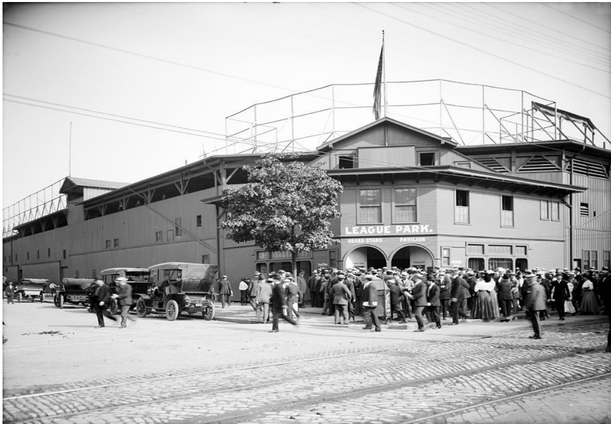
League Park, Cleveland, Ohio

All articles appearing in the Courier do not necessarily state or represent an endorsement of the facts, conclusions, and opinions of the author(s) by the NEOCWRT or its membership.